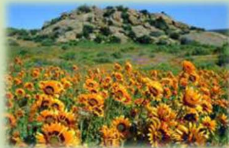
Namaqualand Flower Route

The spring wild flowers are a phenomenon that never ceases to amaze and delight, even for those who live in what is considered South Africa's "outback" – Namaqualand. What at first glance appears to be a wilderness of semi-desert - arid, dusty plains that stretch before one, dramatic mountains in the background, with little by way of colour or animation - is suddenly transformed, as if by a painter with a manic palette, into a pageant of flowers.